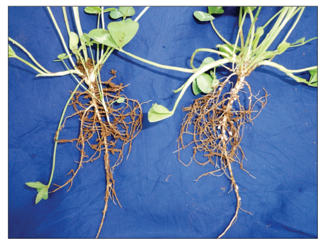
Figure 3: Root nodulation in uninoculated (left) and inoculated (right) white clover plants