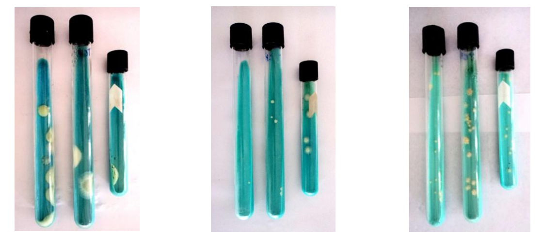
Fig. 1 - : Cultures observed after incubation under different environmental conditions.

The ZN stain confirmed the presence of acid fast bacilli which was observed as slender pink stained rods in the cultures observed (Fig.1) in TCH, PNB and the control L-J media indicating the presence of mycobacteria belonging to Mtb and NTM in the sputum sample of the patient who was suffering with the untreatable pulmonary infection.