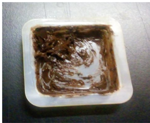
Fig. 2. Appearance of the formulation developed from C. auriculata . The extract was incorporated into the aqueous cream base at different ratios to obtain a formulation with a good spreadability.

auriculata extract according to the DPPH assay. The EC_{50} value for this extract ( 19.99 \mu\text{g/mL} ) was better than one of the two positive controls, BHA ( EC_{50} = 23.12 \mu\text{g/mL} ) and also comparable with the other positive control, ascorbic acid ( EC_{50} = 18.03 \mu\text{g/mL} ).